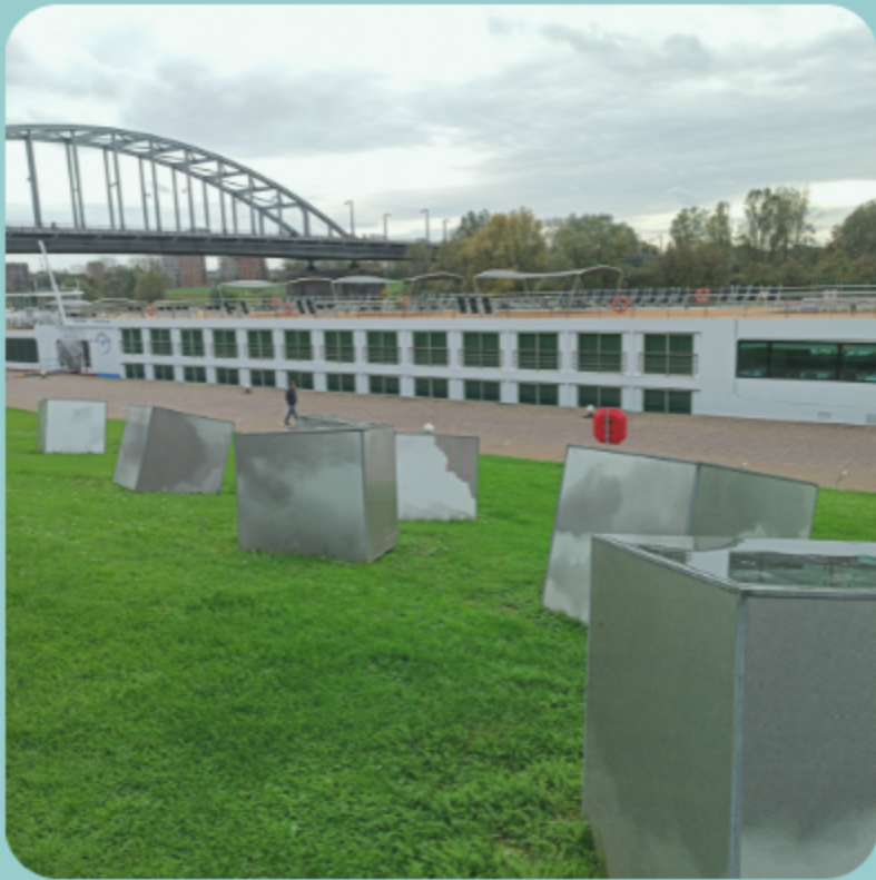
The “Cubes” represent the fighters in the war

The bridge should have been captured by the British 1st Airborne Division.