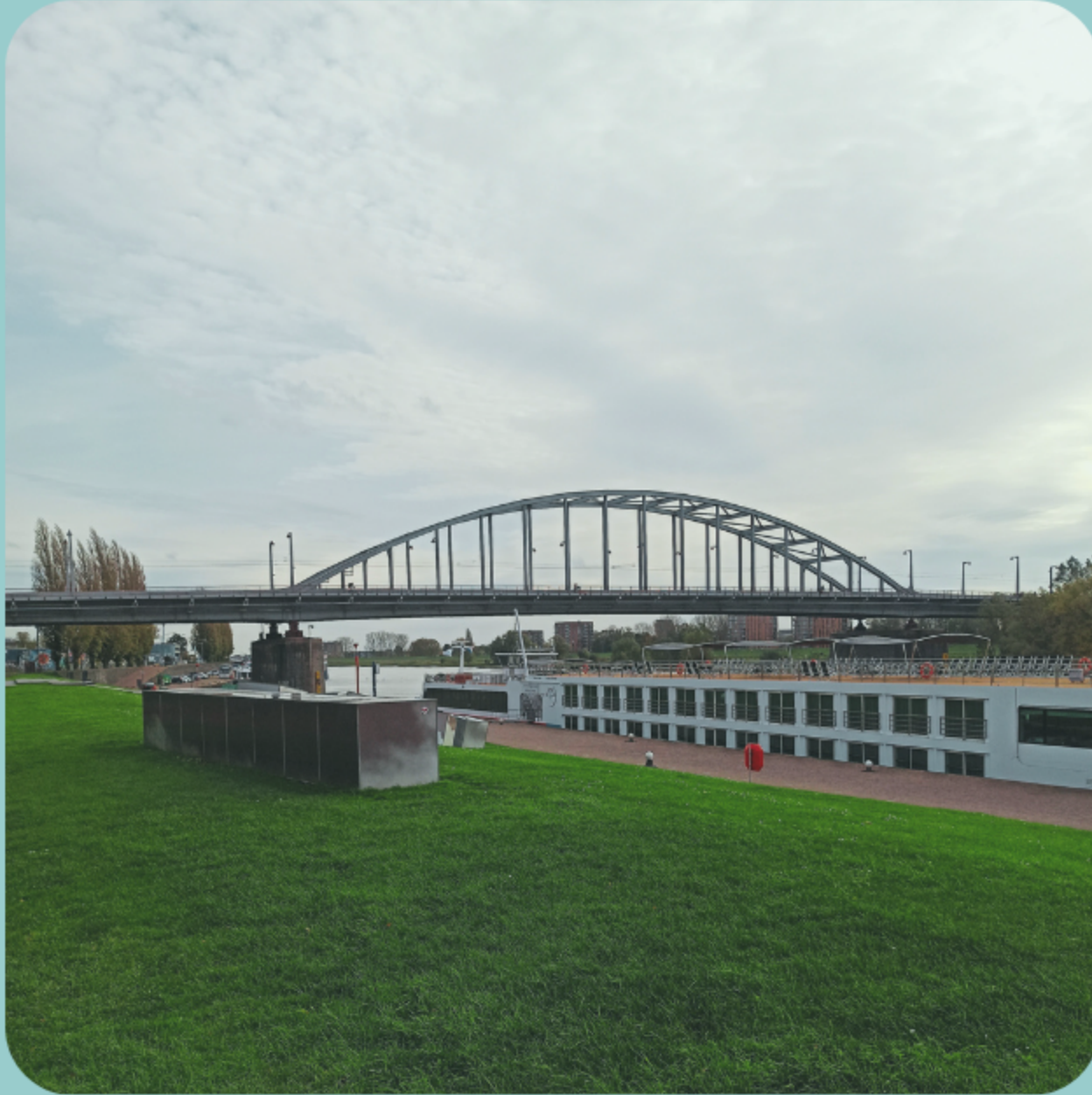
John Frost Bridge (Historic monument)